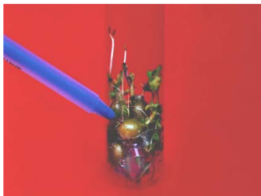
Fig 1. Multiple shooting and more than two micro-tuber formation due to application of MS + 4 mg/L KIN.

MS media supplemented with different concentration of KIN were used for micro tuber production. The data are presented in Table 1. It was revealed that, simple MS media had the ability to produce shoot under in vitro condition. But days required for shoot regeneration was highest (13 days) in control condition. The minimum time (5.09) was required in MS + 4 mg/L KIN treatment, followed by MS + 3 mg/L and MS + 2 mg/L of KIN, respectively. The time variation between two treatments was very less. Shoot per explant was the highest (9.28) in MS + 4 mg/L KIN which was followed by 3, 2 and 1 mg/L KIN, respectively. The simple MS medium produced lowest number of shoot (2.13) per explant. Highest shoot length (8.80 cm) was observed in MS + 2