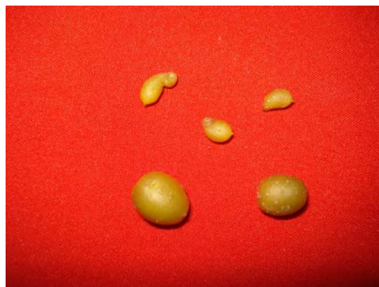
Fig 4. Different types of microtuber production under different treatments.

Leclere et al (1994) observed that, shoots produced microtubers rapidly and in higher number compared to nodal cutting. Myeong et al (1990) studied the influence of several factors affecting in vitro tuberization of shoot nodes in potato. It reveals that, more microtubers were produced on the nodes taken from middle and basal part of shoot than on those from upper part. Kanwal et al. (2006) revealed that node as an explant showed better result on microtuber production. The present find-