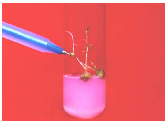
Fig 2. Microtuber production under dark condition.

mg/L KIN which was followed by MS + 3 mg/L and MS + 4 mg/L KIN, respectively (Fig 1). It is interesting to note that, in higher concentration of KIN, number of shoot per explant was higher but the shoot length was lower. On the other hand, in 2 mg/L of KIN shoot length was higher but number of shoot per explant was lower. It reveals that, higher concentration of KIN has the ability to produce more plantlet per explant. As observed in Table 1, micro tuber was not produced in simple